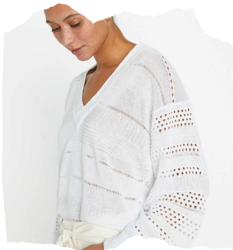
THE SILVIA EYELET VEE By Brochu Walker