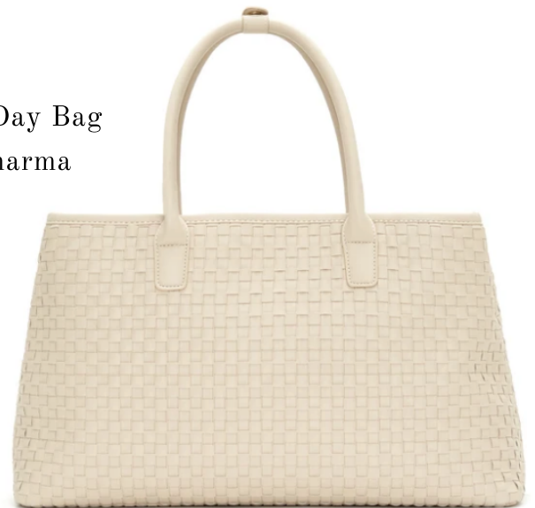
Cream Bala Day Bag by Lulu Dharma