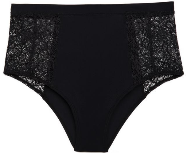
Crosby High-Rise Brief by Liberte