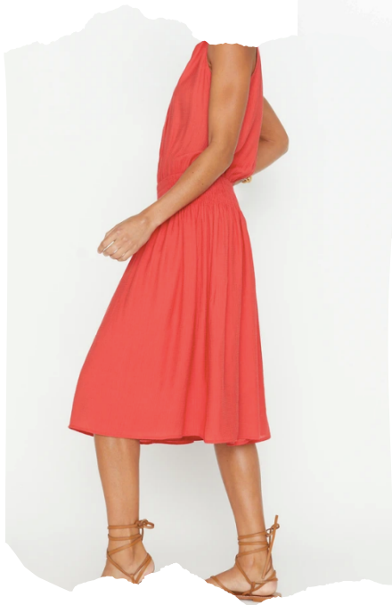
THE FRANCINE DRESS By Brochu Walker