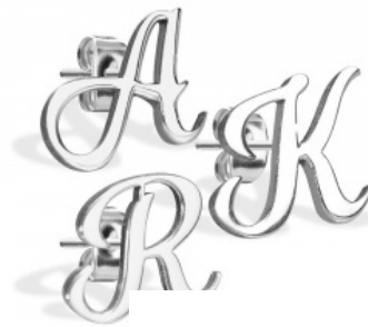
Pair of initial script stud earrings by Pictures on Gold