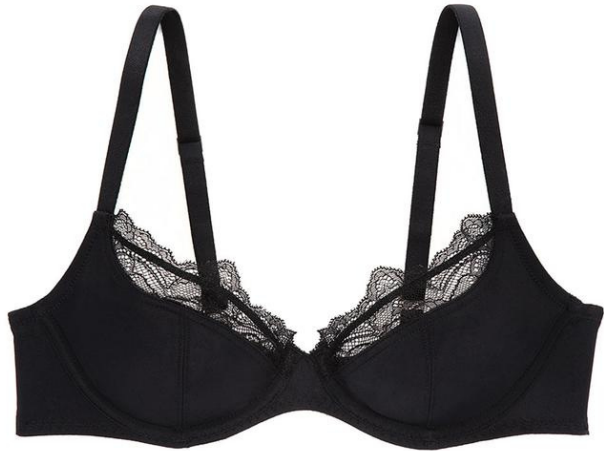
Crosby Plunge Bra by Liberte