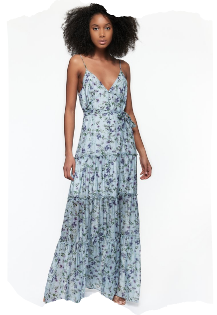
NARIA DRESS BLUE GERANIUM By CAMI NYC