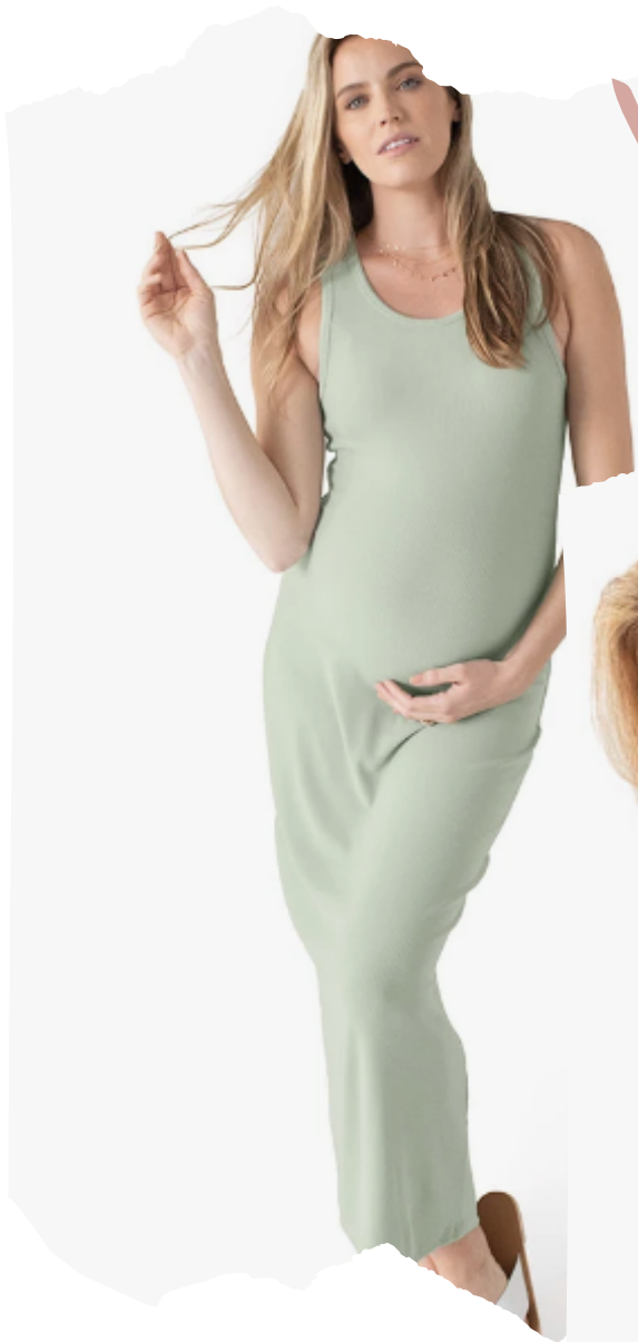
Gwen Ribbed Bamboo Maternity Midi Dress by Kindred Bravely