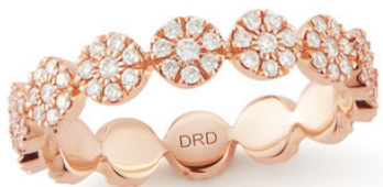
Taylor Beth Eternity Ring by Dana Rebecca